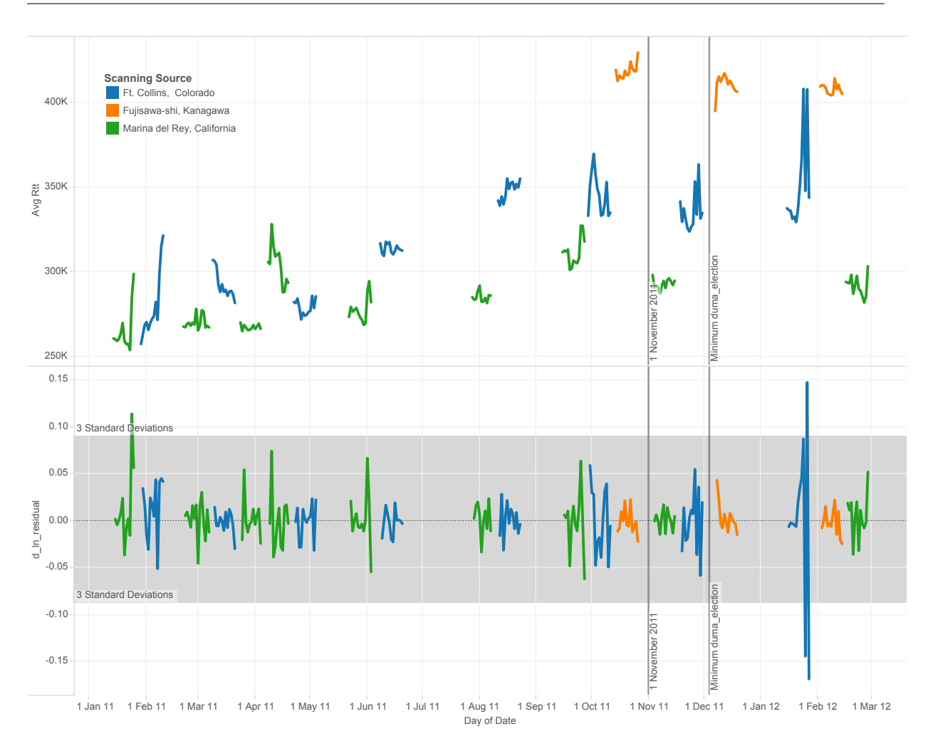
Figure 3: Survey: Average ping times and world traffic corrected difference residuals in Orenburg. Based on 4,382,231 survey probes.

the interaction of interest. The coefficient \beta_3 is the average treatment effect of censorship at the polling station. Standard errors are clustered at sub-region level, to account for serial correlation and to mitigate possible overstating of the statistical significance as emphasised in Bertrand, Duflo, and Mullainathan (2004). To account for other possible hidden government interventions designed to sway voters, the second specification, is estimated with controls that vary between sub-regions and time periods: