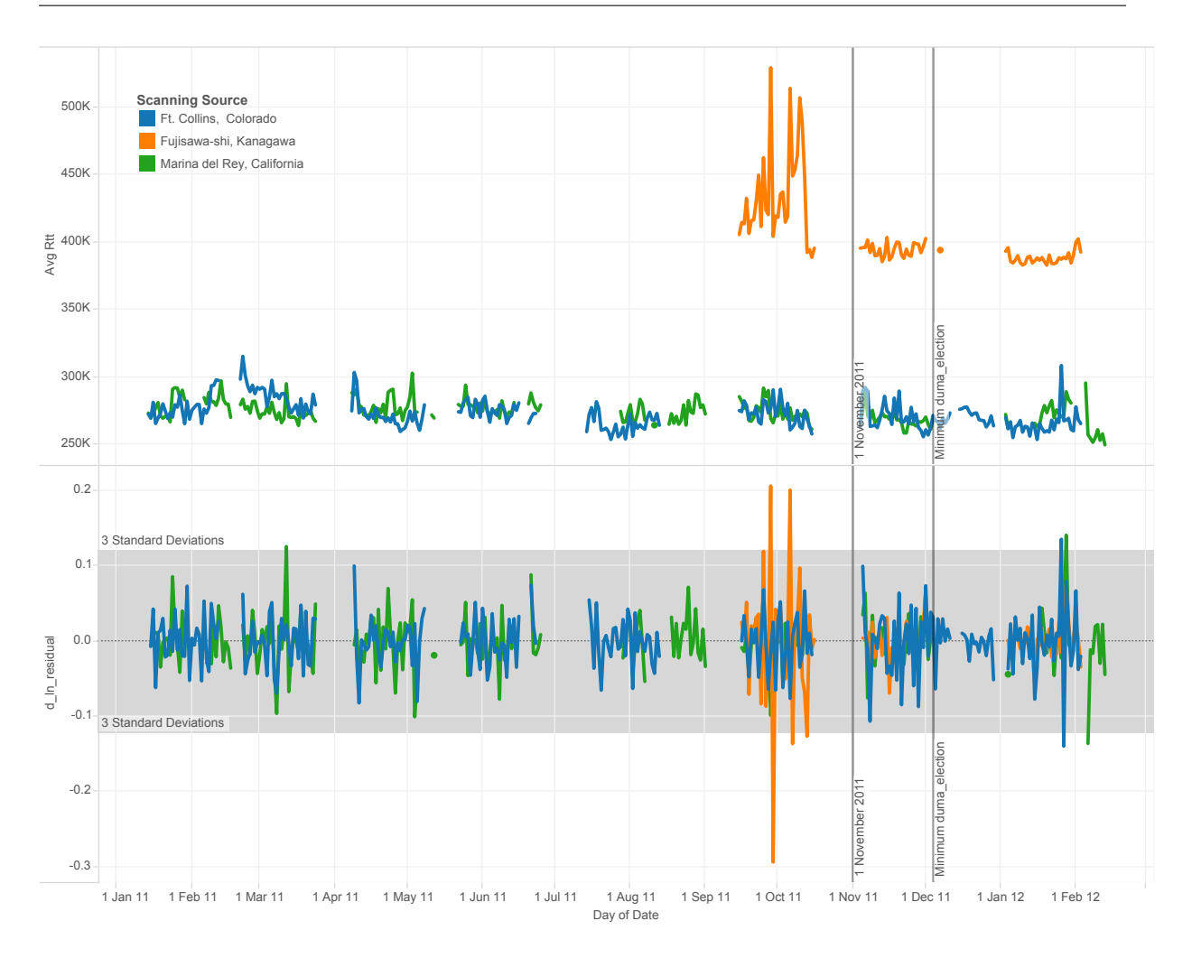
Figure 4: Census: Average ping times and world traffic corrected difference residuals Orenburg. Based on 509,908 census probes.

square kilometres, as well as economic indicators, all in logarithmic scale. A higher density implies a tighter social network compared to less dense areas, which would allow the government to interfere with different channels without the need for election tampering. As pointed out by Klimek et al. (2012), suspiciously high voter turnouts are a signal for ballot stuffing; thus measures are included to account for this possibility. In maintaining consistency with existing economic literature regarding elections in Russia (Enikolopov et al., 2011), income per household, and active physicians per thousand people were used to reflect the strength of public infrastructure. As the estimation strategy relies on a difference in difference design, the controls needed to be time varying. The economic data from the OECD Regional Accounts was available at adm1 level by year and has