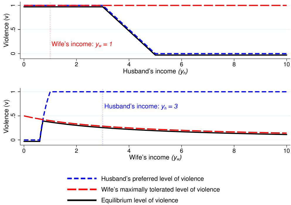
Figure B1: Numerical example of the impact of changes in husband's or wife's income on preferred and equilibrium levels of violence