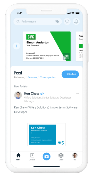
Figure 1.: The Eight Mobile App

Note: The Eight mobile app allows users to scan physical business cards employing the smartphone's camera. High quality digitization is achieved through the usage of advanced OCR algorithms and the help of human operators.