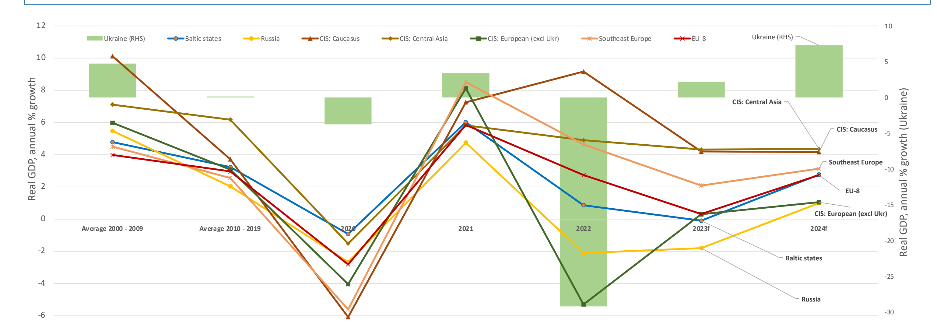
Fig 1. Annual real GDP growth, % || Source: WDI (2023) and FocusEconomics (Aprl 2023). Note: f – forecast; due to the scale effect, data for Ukraine appear on the right hand-side.

This brief essay is an attempt to analytically review the most recent developments in the post-socialist CEE and FSU. The difficulty is to offer a commentary about real-time kaleidoscopic occurrences; a commentary that would hold relevance beyond immediate time horizon. The only true constant variable in the post-socialist region is the volatility of ground-shifting historic events. Those events often turn out to be catastrophic to the society's institutional fabric, systemic continuity, and economic development. Recently, the sad reality in the bigger part of the post-socialist realm, has been filled with precisely such type of destructive events. History's chokehold, especially on the fates of the smallest economies, seems to be inescapable.