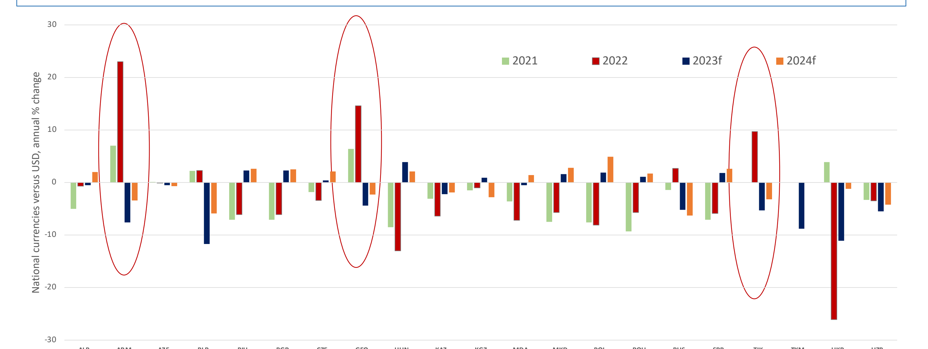
Fig 2. Exchange rate, national currencies versus USD, annual % change. || Source: WDI (2023) & FocusEconomics (2023); f – forecast.

Drivers and RISKs of FX appreciation (Fig 2): 1) Labor migrants' remittances; 2) individual relocation; 3) corporate relocation; 4) increased trade - <u>risks in reversals</u>.