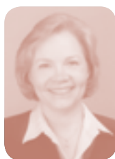
Board Member Biography