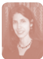
Board Member Biography