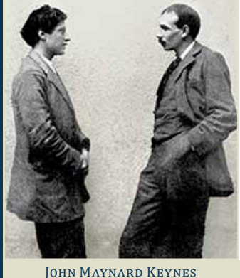
AND DUNCAN GRANT (ABOUT 1913)

http://en.wikipedia.org/wiki/duncan_grant